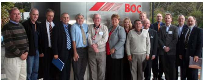
2008 RDAC Leaders outside BOC Offices in North Ryde

There are no higher priorities for BOC as an organisation, than the health and safety of their employees, customers, suppliers and the broader community. As part of this genuine commitment, they provide their employees with internal safety schemes, such as the BOC Healthy Choices initiative and the benchmarked BOC Driver Safety programme, which promotes safe driving behaviour 100% of the time.