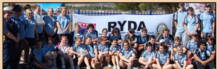
Below: Students from West Wyalong on the LBT's inaugural journey.